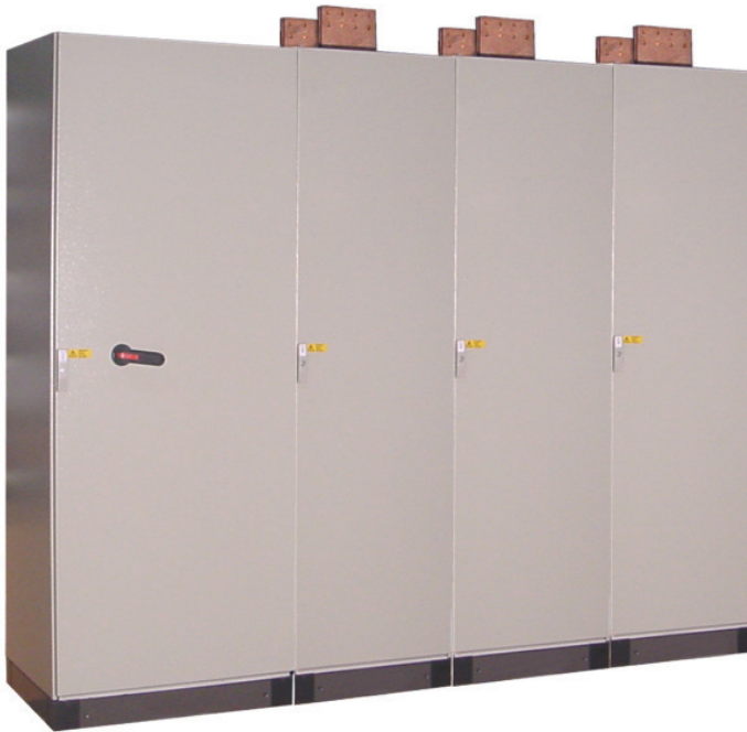
POWER STATION pe5040-W, front view, with 1000mm-supply cabinet

Water cooled DC power supply in switch mode technology, designed for the direct installation at the electroplating tank.