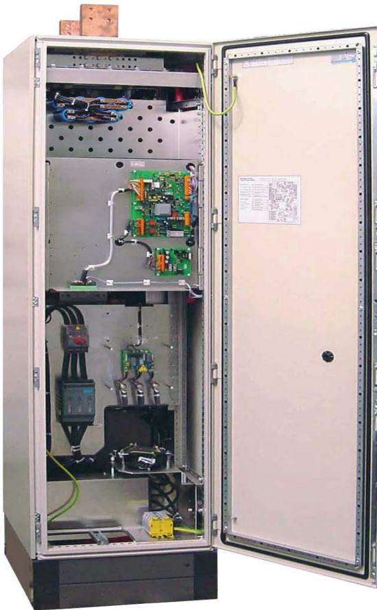
POWER STATION pe5010-W, front view

Water cooled DC power supply in switch mode technology, designed for the direct installation at the electroplating tank.